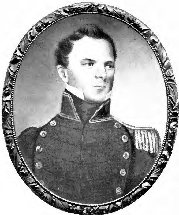
HIRAM PAULDING Lieutenant, U. S. N. About 1828